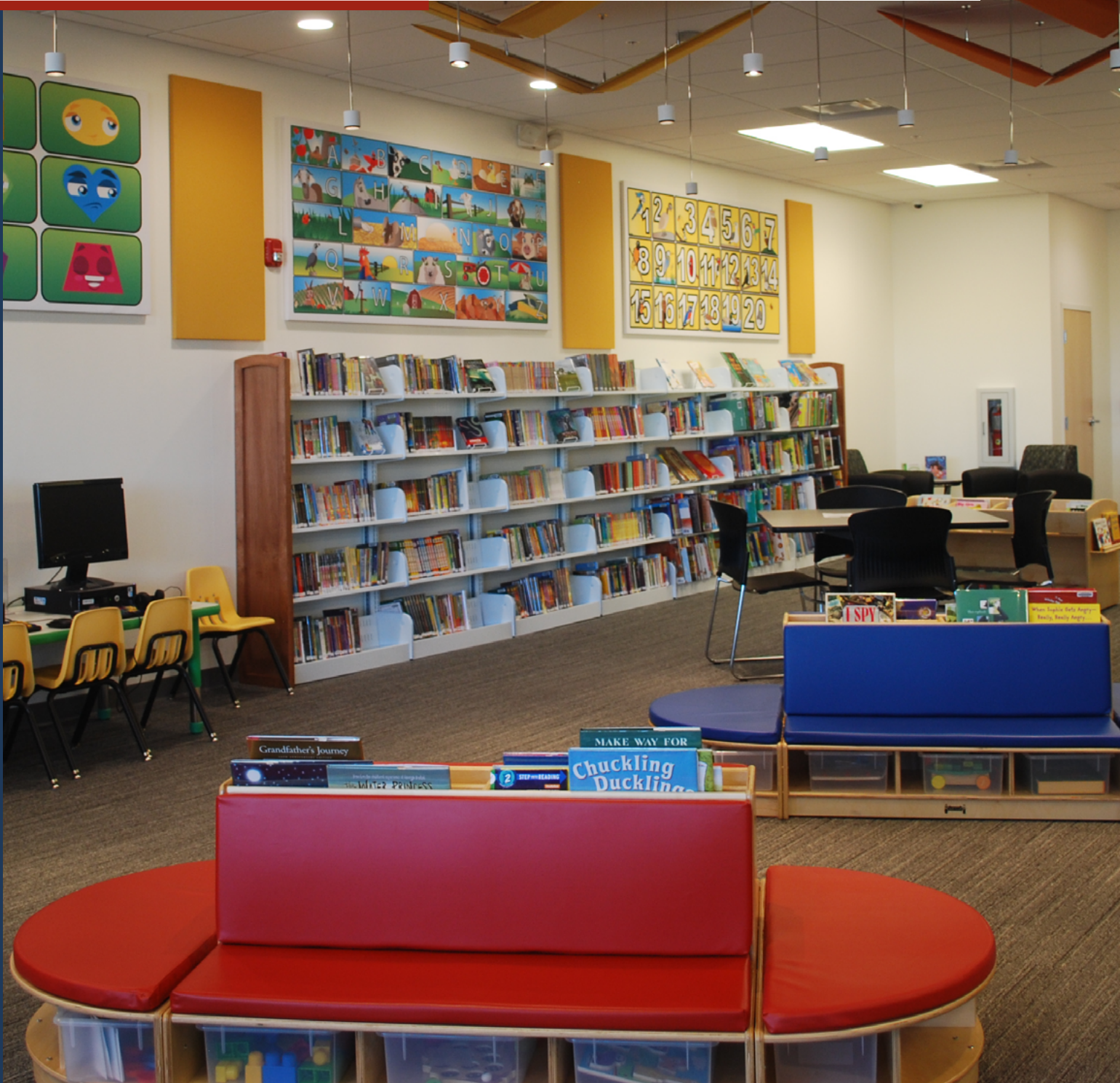
Sycamore Plaza Library | Pickerington, OH | Interior Renovation